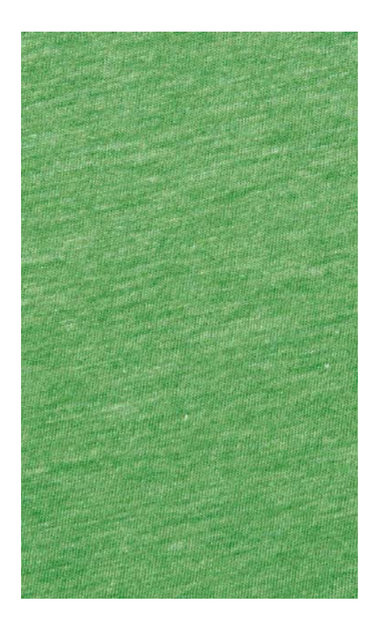
50% polyester, 25% Airlume combed and ring-spun cotton, 25% rayon, 40 singles, 3.8 oz.

Our Triblend fabric— an industry innovation as the first 40 singles triblend of its kind— offers the softest and smoothest printing surface.