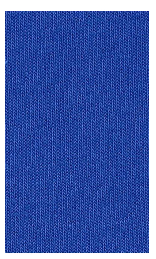
52% Airlume combed and ring-spun cotton, 48% polyester fleece, 32 singles, 8.0 oz.

Our signature Sponge Fleece answers the demand of a high-growth category with a mid-weight, soft, and incredibly versatile fabric that dresses up or down for unmatched comfort year-round.